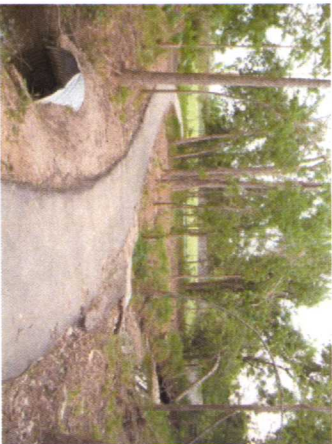
Minimized Clearing and Grading