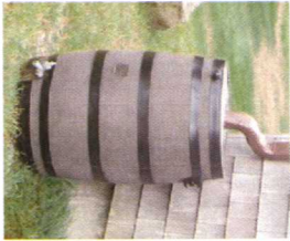
Impervious Surfaces Disconnection