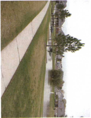
Open Space Maintenance Practices