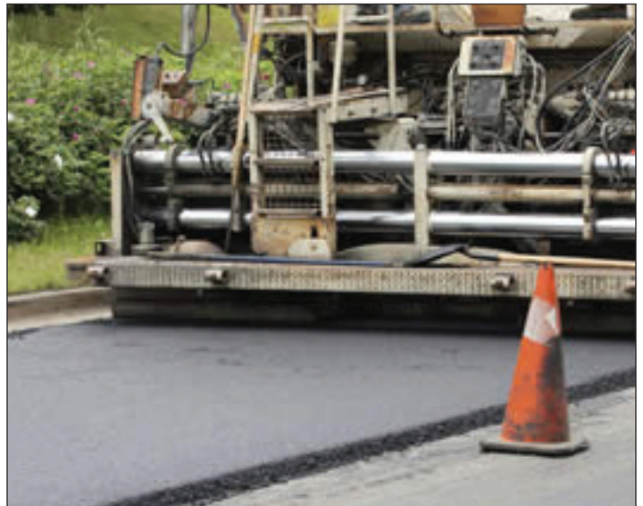
Thanks to a recently completed Street Index, the Streets and Stormwater Department is in a better position to prioritize street improvements.