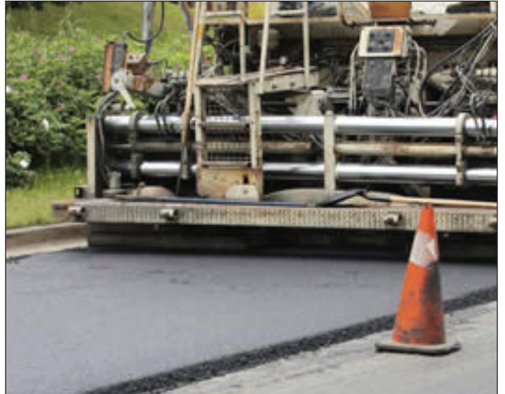
Thanks to a recently completed Street Index, the Streets and Stormwater Department is in a better position to prioritize street improvements.