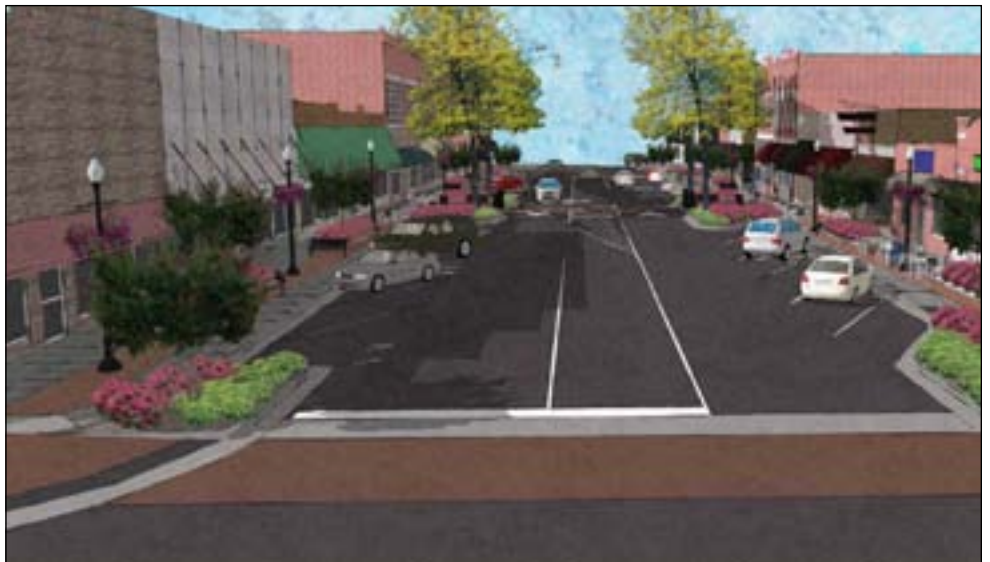
Above is an artist rendering of what Main Street Broken Arrow could look like once the streetscape plan is implemented.

Additionally, while construction is occurring, the website will feature regular construction updates and progress on the homepage.