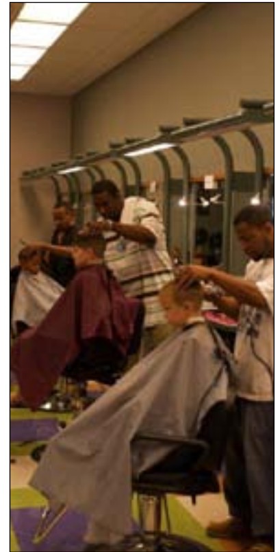
Free haircuts provided by cosmetology students at tech and professional hairstylist